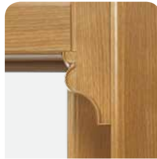
Run through horns Ideal for properties in conservation areas*