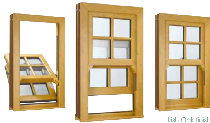
Irish Oak finish

What's more, PVC-U requires very little maintenance to keep your windows looking as good as new. No painting or preservative treatments are required. An occasional wipe down with a damp cloth is all that's needed to keep the frames looking as bright and attractive as the day they were fitted.