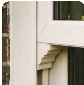
Decorative horns Shown in Cream