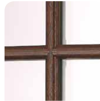
Georgian bars Shown in Rosewood*

Our vertical sliding sash windows enable you to achieve a classic, distinctive look for your home, with all the high-performance, low-maintenance benefits of PVC-U. And they're suitable for conservation areas too – we've recently added a deep bottom rail and decorative run-through horn to the range for the ultimate in traditional looks.